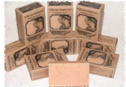
One of the many environmentally friendly products available at cmartisans.com .