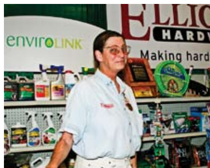
Elliott's has been exhibiting at the Expo since 2007.

Elliott's Hardware • Plano • Dallas • Mesquite